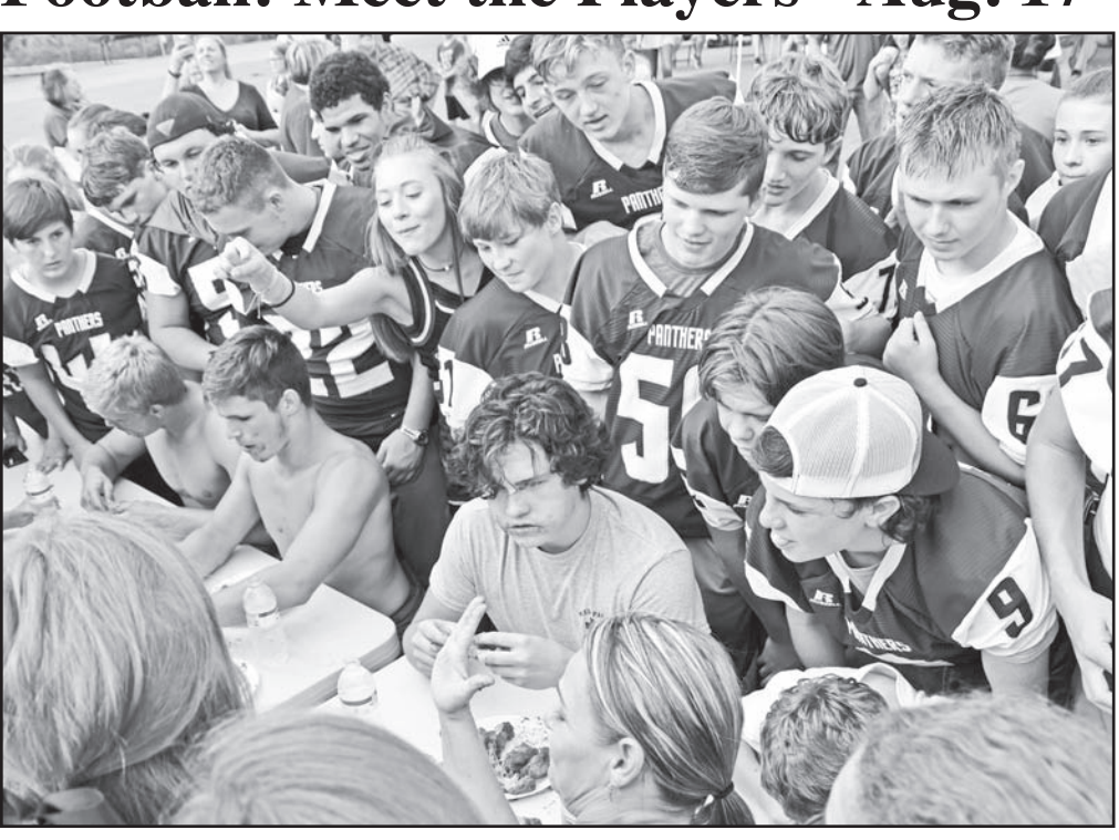
The highlight of last year's Meet the Team event was a chicken wing eating contest that was won by a UCHS cheerleader. This year's event is scheduled for Friday Aug. 17 from 5:30 p.m. to 7 p.m.